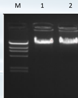
Lane M: \lambda Hind III digest marker Lane1, 2: Test Sample